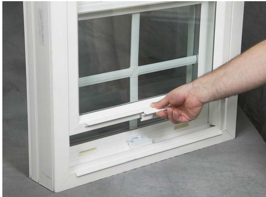
Photo 3 Raise interior bottom sash 4-6 inches.