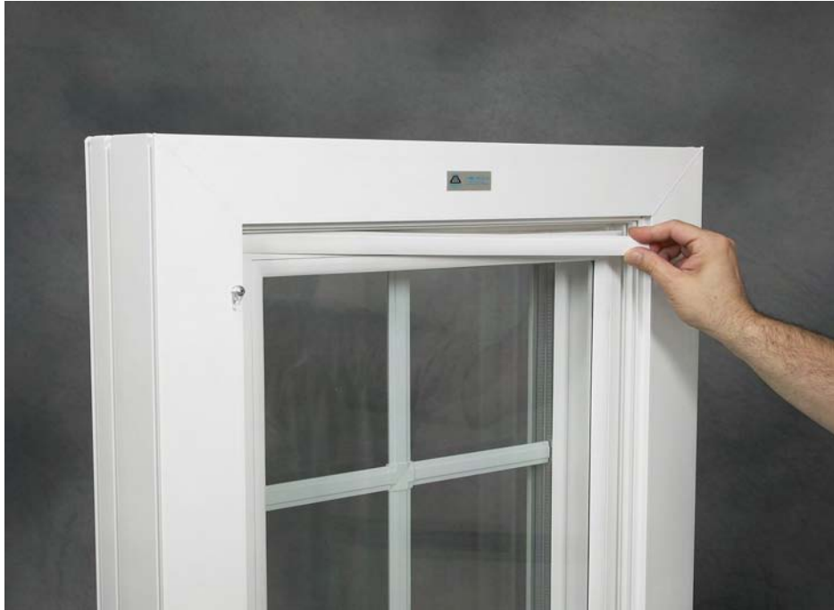
Photo 32 Top glazing bead removal.