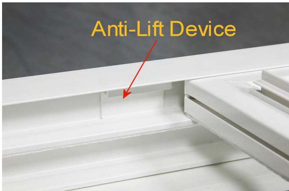
Photo 21 Open sash past anti-lift device.