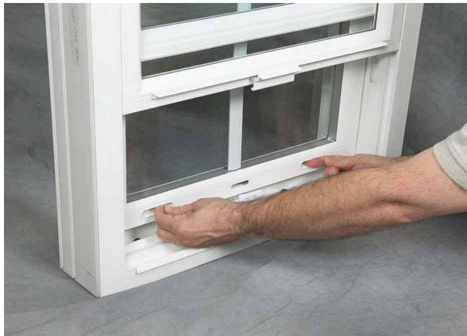
Photo 5 Raise exterior bottom sash 2-4 inches.