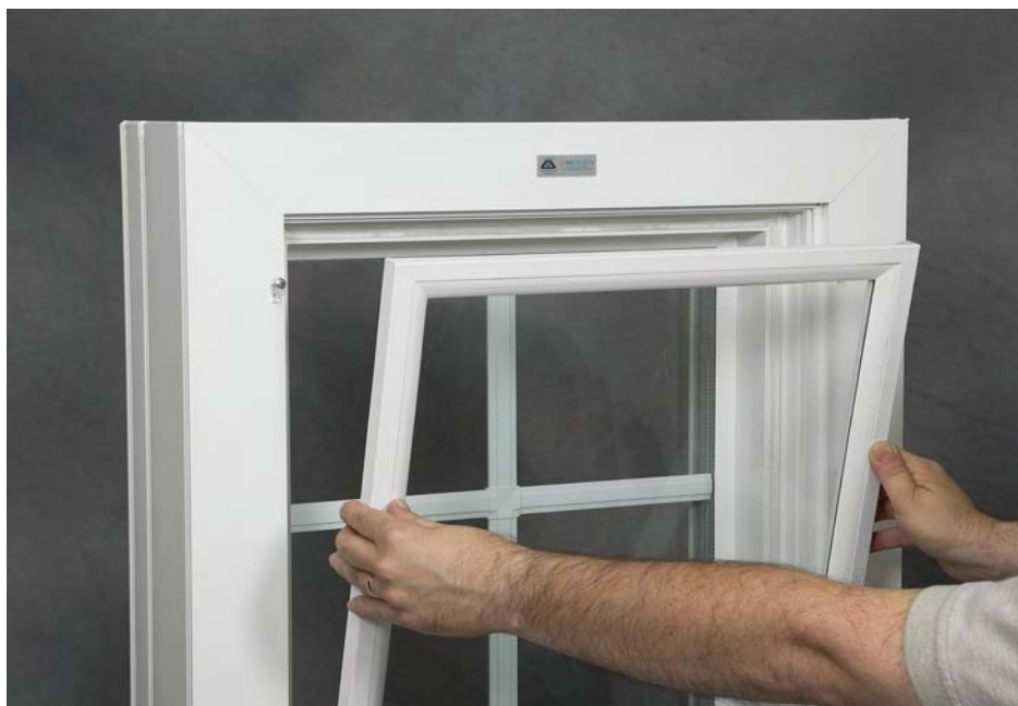
Photo 33 Tilt top of sash inward and grasp side rails.