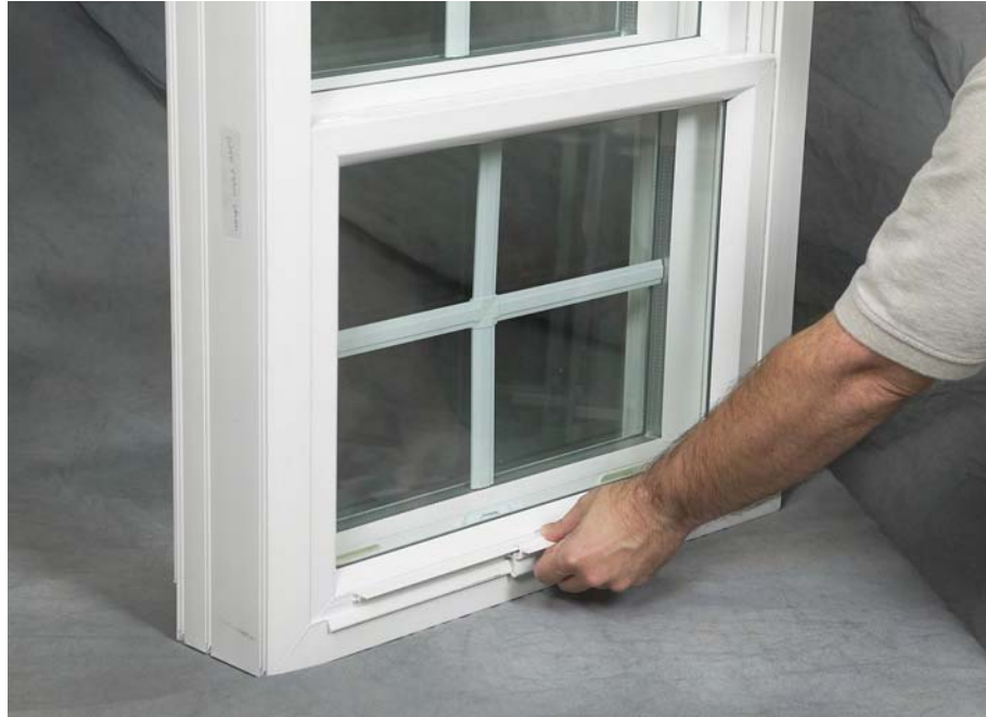
Photo 2 Unlock interior bottom sash.