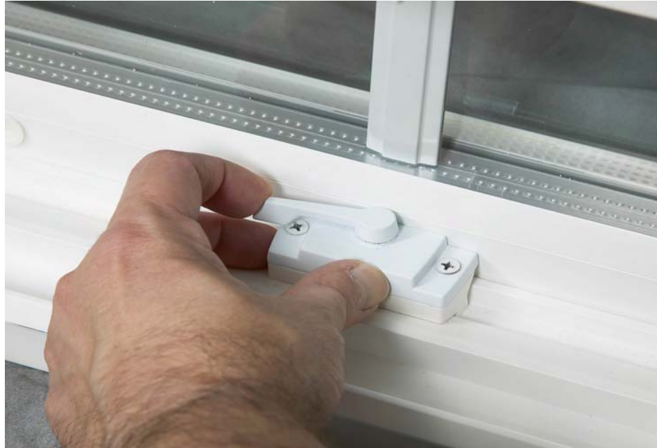
Photo 4 Unlock exterior bottom sash.