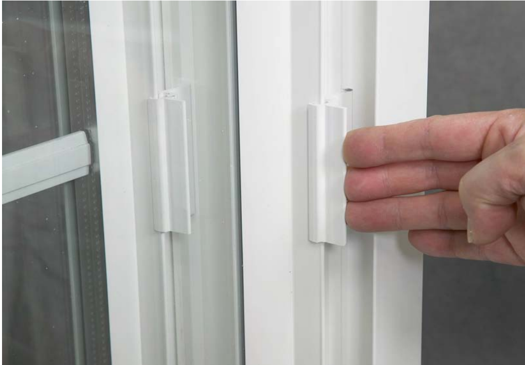
Photo 20 Release sash lock.