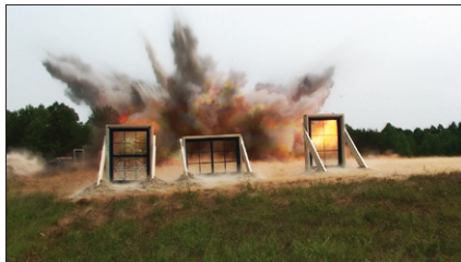
FPED VI, Quantico, V

Arena Testing is conducted with an actual explosive charge of specified weight, positioned at a predetermined standoff distance. This test produces both the positive and negative phase blast effects.